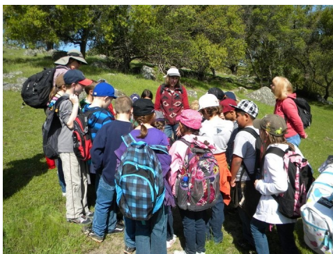
3rd grade field trip to the Sutter Buttes

A percentage of all sales will be donated to FESDEF. For more information go to fesdef.com and click on Fund Raising Events.