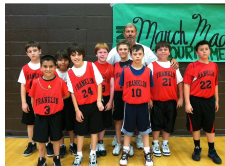
FESDEF sponsored 4th and 5th grade Franklin students to compete in a basketball tournament.

It's not too late to make your Club 180 donation for the 2010/2011 school year. Please visit our website at www.fesdef.com .